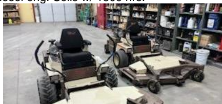
2001 Grasshopper 928D riding mower w/ diesel eng. Sells w/ 2093 hrs.