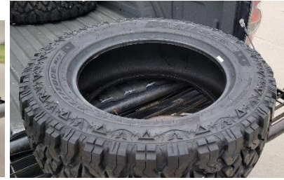
* 2015 PJ tandem dual 26' GN flatbed w/ 3 pc. Ramp * 28' GN flatbed trailer * SV 300 skid loader * 2 new Goodyear LT 285/60R20 Fierce Attitude MT tires